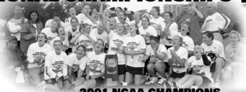
2001 NCAA CHAMPIONS