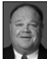
Jim Knight Equipment